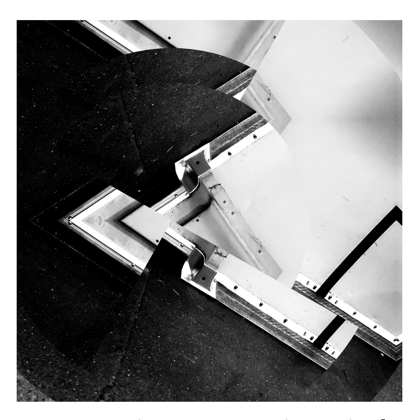
San Francisco Tape Music Festival